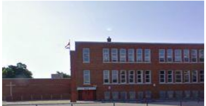
St Theresa Shrine Catholic School

God bless you in the Name of the Father, of the Son and of The Holy Spirit. Amen.