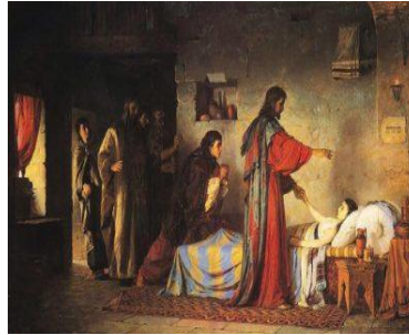
Visily Polenov, 1871

God, who formed us in His imperishable image, did not intend for us to die, we hear in today's First Reading. Death entered the world through the devil's envy