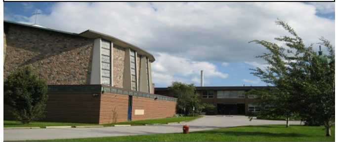
St. John Henry Newman Catholic High School