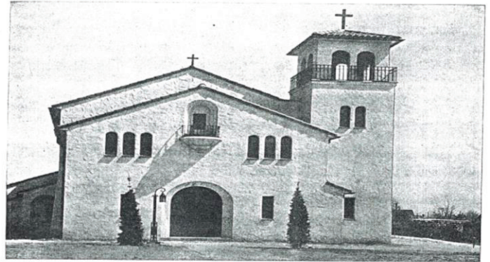
FRONT VIEW - CHURCH OF ST. THERESA OF THE CHILD JESUS

The First Official Mass in the Original Church Building